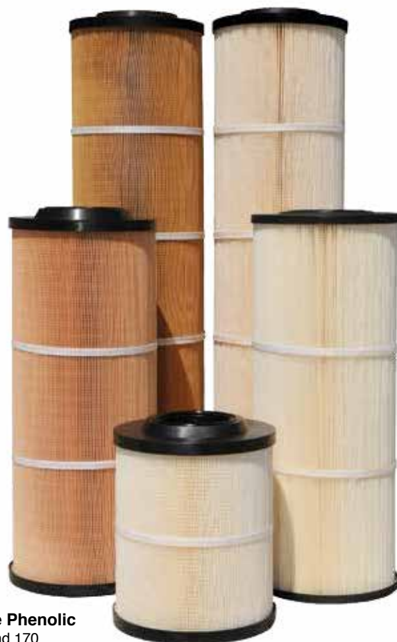
Cellulose Phenolic 90 and 170