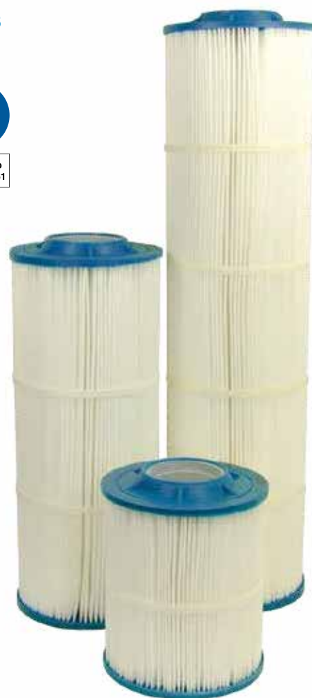
Premium Hurricane® Harmsco-Free Cartridges