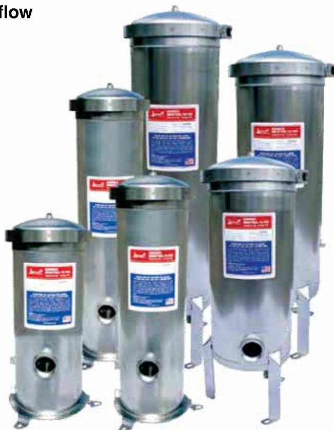
Models BC4-1, BC4-2, BC4-3, BC6-1, BC6-2, BC6-3

316 stainless steel Sanitary, BSTP or victaulic connections