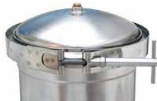
Band Clamp Assembly