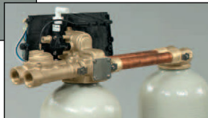
▶ Back (without cover)