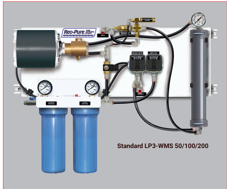
Standard LP3-WMS 50/100/200